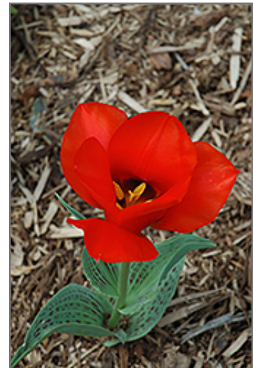
Casa Grande Tulip flowers