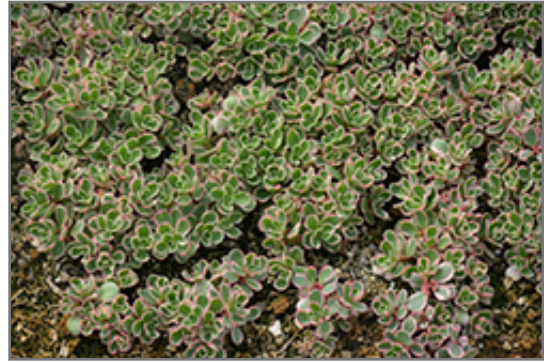
Tricolor Stonecrop flowers

Tricolor Stonecrop will grow to be only 4 inches tall at maturity, with a spread of 18 inches. When grown in masses or used as a bedding plant, individual plants should be spaced approximately 15 inches apart. Its foliage tends to remain low and dense right to the ground. It grows at a fast rate, and under ideal conditions can be expected to live for approximately 10 years. As an herbaceous perennial, this plant will usually die back to the crown each winter, and will regrow from the base each spring. Be careful not to disturb the crown in late winter when it may not be readily seen!