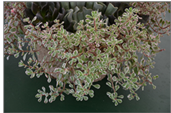
Tricolor Stonecrop