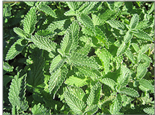
Walker's Low Catmint foliage

Walker's Low Catmint is a fine choice for the garden, but it is also a good selection for planting in outdoor pots and containers. It is often used as a 'filler' in the 'spiller-thriller-filler' container combination, providing a mass of flowers against which the thriller plants stand out. Note that when growing plants in outdoor containers and baskets, they may require more frequent waterings than they would in the yard or garden. Be aware that in our climate, most plants cannot be expected to survive the winter if left in containers outdoors, and this plant is no exception. Contact our experts for more information on how to protect it over the winter months.