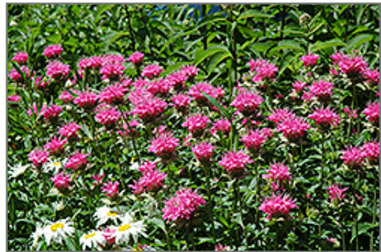
Marshall's Delight Beebalm flowers