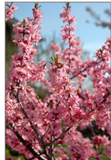
Muckle Plum flowers