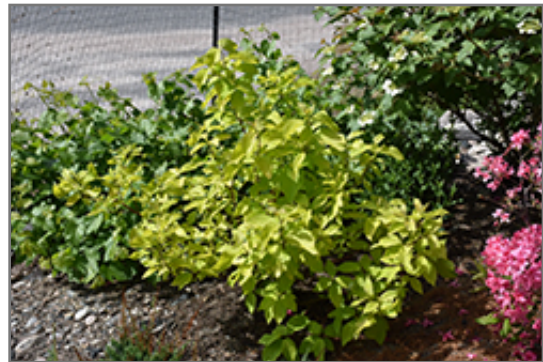
Neon Burst Dogwood