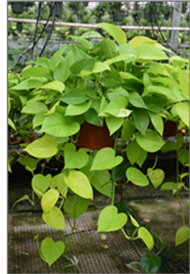
Neon Pothos in full

When grown indoors, Neon Pothos can be expected to grow to be about 5 feet tall at maturity, with a spread of 24 inches. It grows at a fast rate, and under ideal conditions can be expected to live for approximately 10 years. This houseplant performs well in both bright or indirect sunlight and strong artificial light, and can therefore be situated in almost any well-lit room or location. It does best in average to evenly moist soil, but will not tolerate standing water. The surface of the soil shouldn't be allowed to dry out completely, and so you should expect to water this plant once and possibly even twice each week. Be aware that your particular watering schedule may vary depending on its location in the room, the pot size, plant size and other conditions; if in doubt, ask one of our experts in the store for advice. It is not particular as to soil type or pH; an average potting soil should work just fine. Be warned that parts of this plant are known to be toxic to humans and animals, so special care should be exercised if growing it around children and pets.