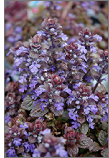
Bronze Beauty Bugleweed flowers

Bronze Beauty Bugleweed is recommended for the following landscape applications;