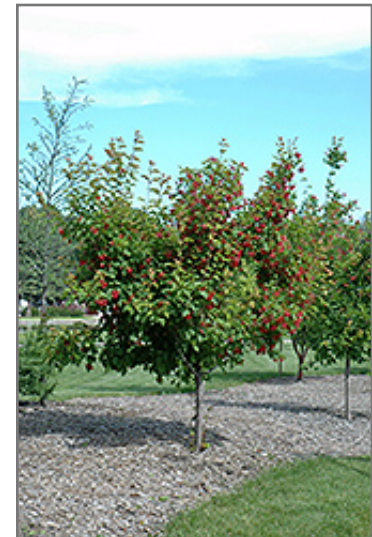
Ruby Slippers Amur Maple