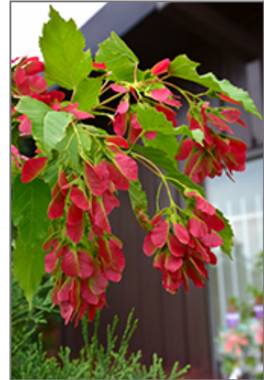
Ruby Slippers Amur Maple fruit