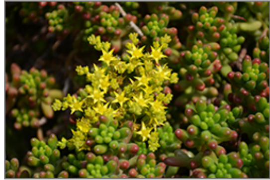
Jelly Bean Plant flowers

Jelly Bean Plant will grow to be only 5 inches tall at maturity, with a spread of 14 inches. When grown in masses or used as a bedding plant, individual plants should be spaced approximately 10 inches apart. Its foliage tends to remain low and dense right to the ground. It grows at a medium rate, and under ideal conditions can be expected to live for approximately 10 years. As an evergreen perennial, this plant will typically keep its form and foliage year-round.