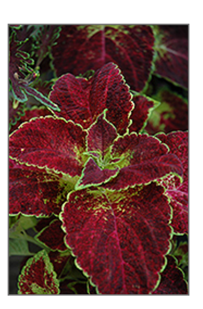
ColorBlaze Dipt in Wine Coleus foliage