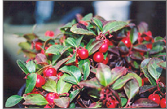
Creeping Wintergreen fruit

Creeping Wintergreen is recommended for the following landscape applications;