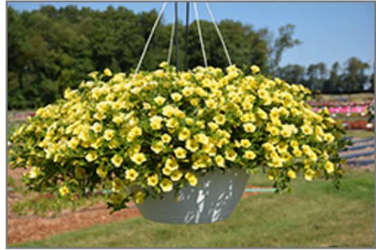
Million Bells Trailing Yellow Calibrachoa in bloom

Million Bells Trailing Yellow Calibrachoa is a fine choice for the garden, but it is also a good selection for planting in outdoor containers and hanging baskets. Because of its trailing habit of growth, it is ideally suited for use as a 'spiller' in the 'spiller-thriller-filler' container combination; plant it near the edges where it can spill gracefully over the pot. It is even sizeable enough that it can be grown alone in a suitable container. Note that when growing plants in outdoor containers and baskets, they may require more frequent waterings than they would in the yard or garden.