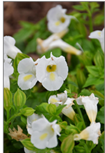
Catalina White Linen Torenia flowers