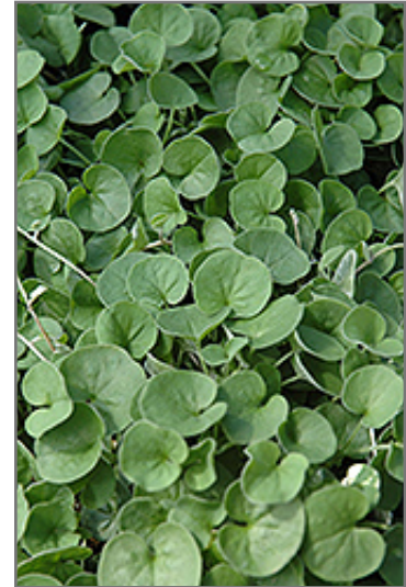
Emerald Falls Dichondra foliage