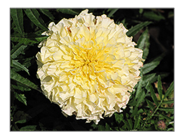
Vanilla Marigold flowers