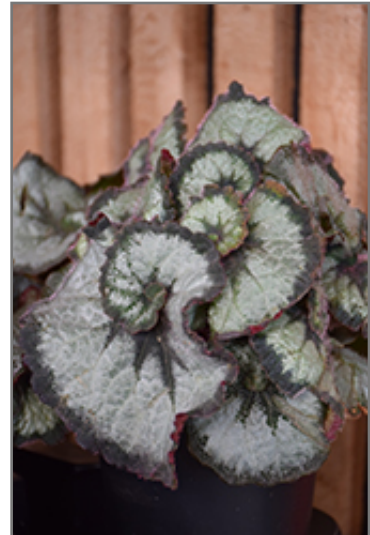
Escargot Begonia foliage