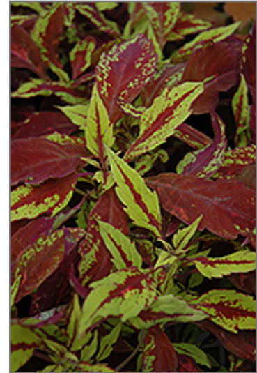
Pineapple Coleus foliage