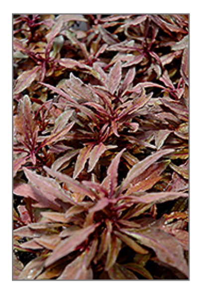
ColorBlaze Velvet Mocha Coleus foliage