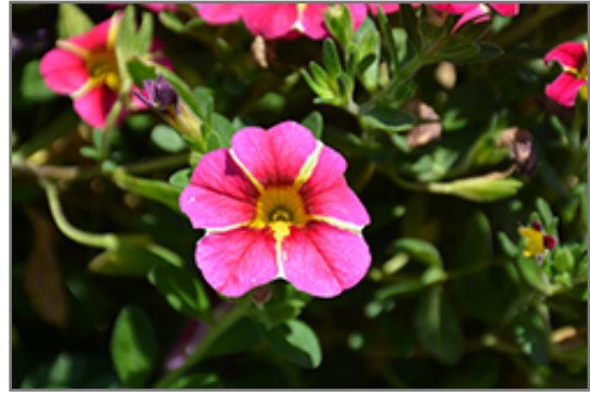
Superbells Cherry Star Calibrachoa flowers

Superbells Cherry Star Calibrachoa is a dense herbaceous annual with a trailing habit of growth, eventually spilling over the edges of hanging baskets and containers. Its medium texture blends into the garden, but can always be balanced by a couple of finer or coarser plants for an effective composition.