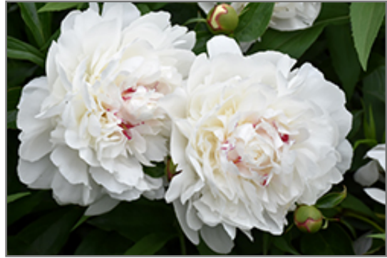
Festiva Maxima Peony flowers

Festiva Maxima Peony is recommended for the following landscape applications;