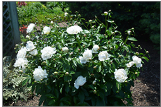
Festiva Maxima Peony in bloom