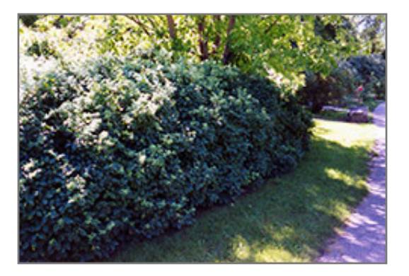
Clavey's Dwarf Honeysuckle