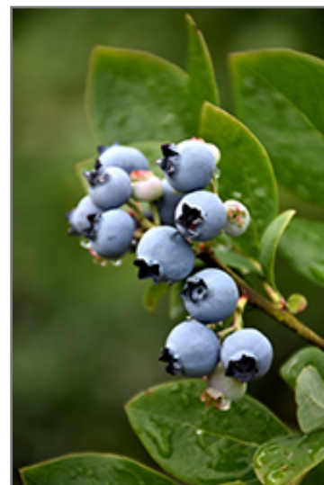
Northblue Blueberry fruit

Aside from its primary use as an edible, Northblue Blueberry is suitable for the following landscape applications;