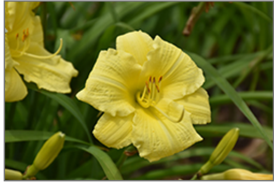
Rainbow Rhythm Going Bananas Daylily flowers