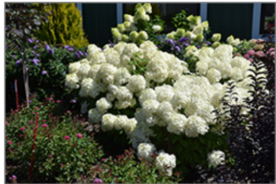
Puffer Fish Hydrangea in bloom