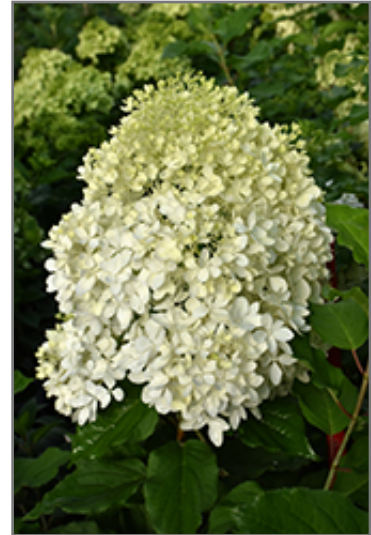
Puffer Fish Hydrangea flowers