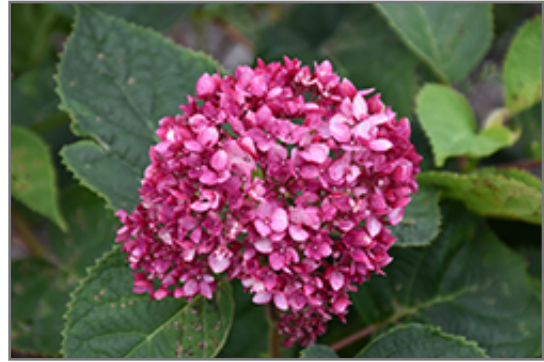
Invincibelle Garnetta Smooth Hydrangea flowers