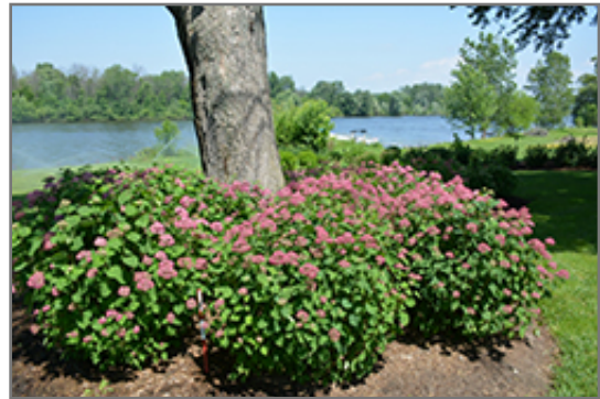
Invincibelle Garnetta Smooth Hydrangea in bloom