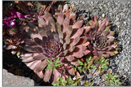
Kalinda Hens And Chicks

Kalinda Hens And Chicks is recommended for the following landscape applications;