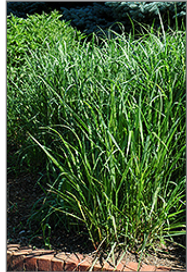
Switch Grass

Switch Grass will grow to be about 4 feet tall at maturity, with a spread of 3 feet. It tends to be leggy, with a typical clearance of 1 foot from the ground, and should be underplanted with lower-growing perennials. It grows at a medium rate, and under ideal conditions can be expected to live for approximately 15 years. As an herbaceous perennial, this plant will usually die back to the crown each winter, and will regrow from the base each spring. Be careful not to disturb the crown in late winter when it may not be readily seen!