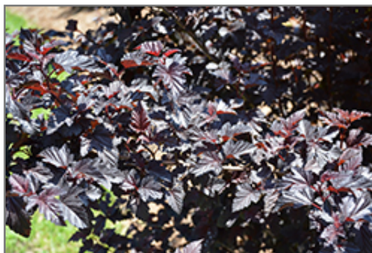
Summer Wine Black Ninebark foliage