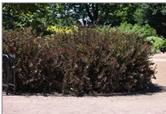
Summer Wine Black Ninebark