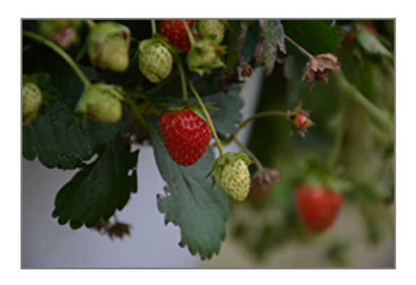
Berried Treasure Pink Strawberry fruit