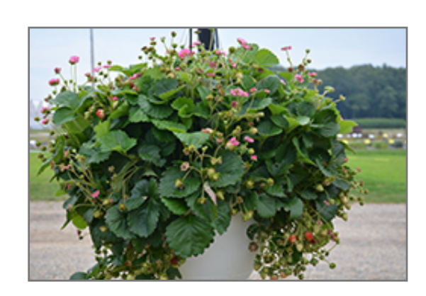
Berried Treasure Pink Strawberry

At Dutch Growers, we treat this plant as a "HOBBY PLANT". It is not officially recognized as