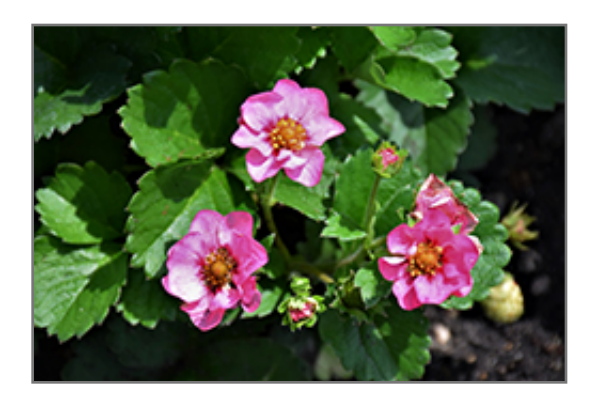
Berried Treasure Pink Strawberry flowers

Berried Treasure Pink Strawberry has masses of beautiful pink daisy flowers with gold eyes along the stems from early to late summer, which are most effective when planted in groupings. Its round compound leaves remain green in colour throughout the season. It features an abundance of magnificent red berries from early summer to early fall.