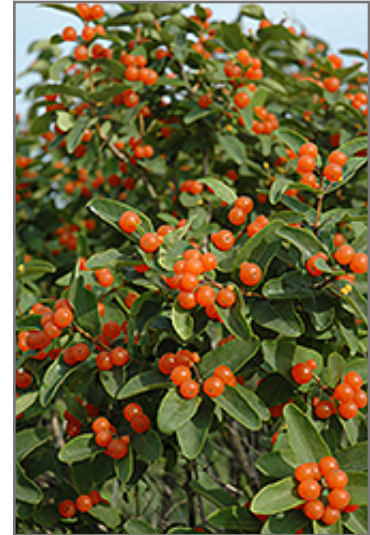
Tatarian Honeysuckle fruit

This shrub does best in full sun to partial shade. It prefers to grow in average to moist conditions, and shouldn't be allowed to dry out. It is not particular as to soil type or pH. It is highly tolerant of urban pollution and will even thrive in inner city environments. This species is not originally from North America.