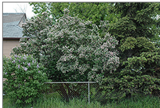
Tatarian Honeysuckle in bloom