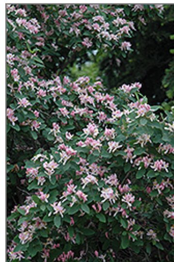
Tatarian Honeysuckle flowers