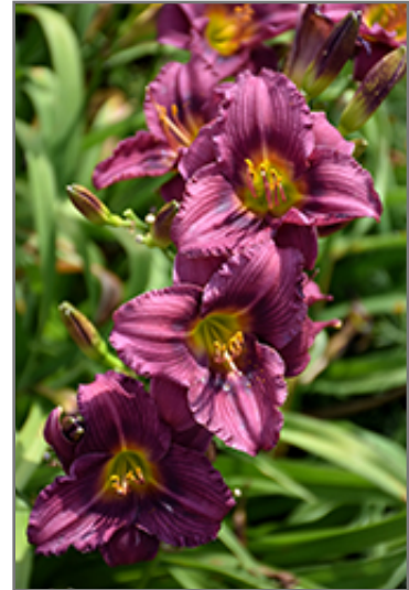
Little Grapette Daylily flowers