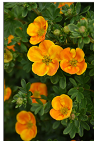
Mandarin Tango Potentilla flowers