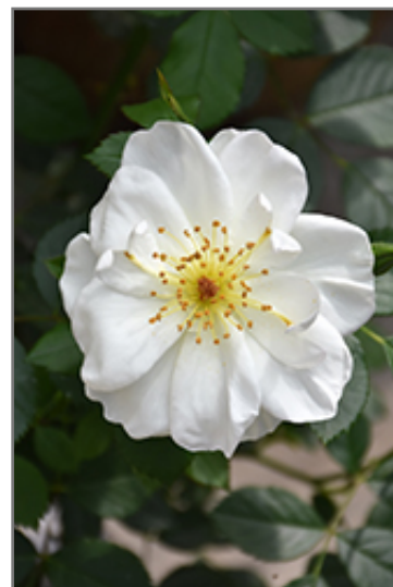
Oscar Peterson Rose flowers