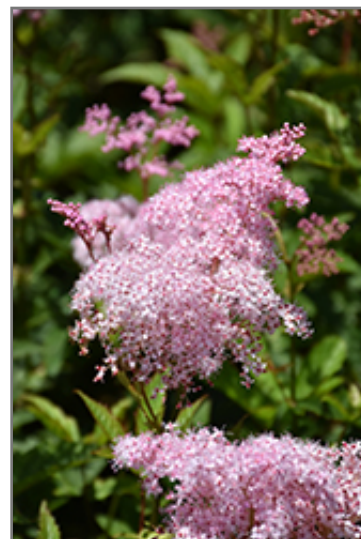
Queen Of The Prairie flowers