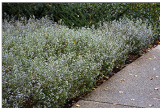
Dwarf Calamint in bloom

Dwarf Calamint is recommended for the following landscape applications;