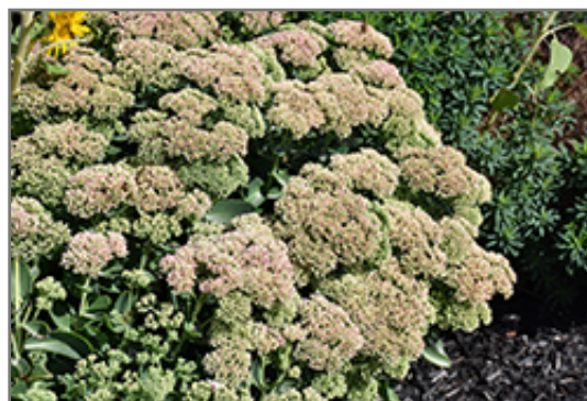
Autumn Joy Stonecrop in bloom