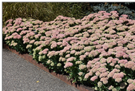
Autumn Joy Stonecrop in bloom

Autumn Joy Stonecrop is recommended for the following landscape applications;