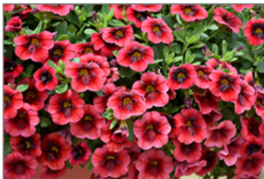
Superbells Pomegranate Punch Calibrachoa flowers

Superbells Pomegranate Punch Calibrachoa is recommended for the following landscape applications;