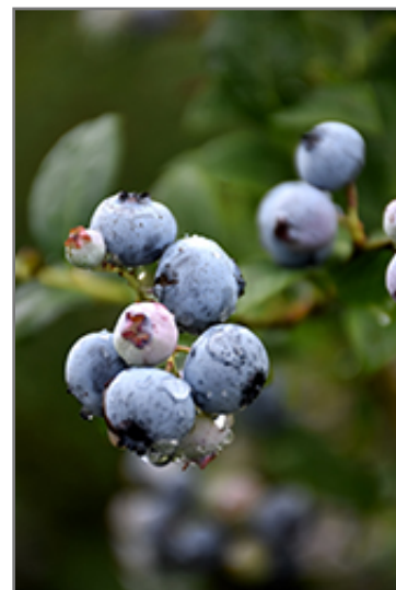
Polaris Blueberry fruit

Polaris Blueberry features dainty clusters of white bell-shaped flowers with shell pink overtones hanging below the branches in mid spring. It has green deciduous foliage. The glossy oval leaves turn an outstanding orange in the fall. It features an abundance of magnificent blue berries with purple overtones in mid summer.