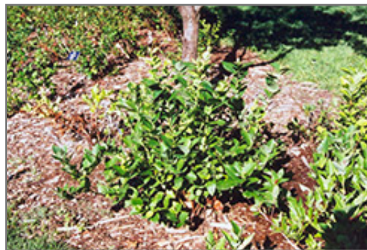
Polaris Blueberry Photo courtesy of NetPS Plant Finder