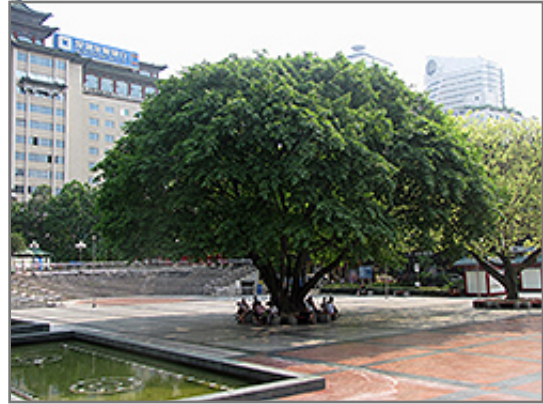
Indian Laurel Fig

Indian Laurel Fig will grow to be about 25 feet tall at maturity, with a spread of 25 feet. It has a low canopy with a typical clearance of 1 foot from the ground, and is suitable for planting under power lines. It grows at a medium rate, and under ideal conditions can be expected to live for 50 years or more.