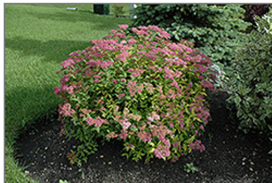
Goldflame Spirea in bloom