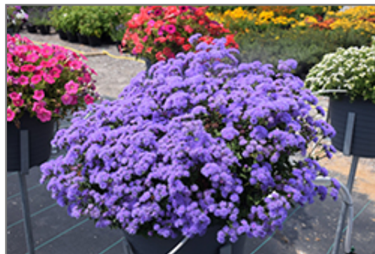
Artist Blue Flossflower in bloom