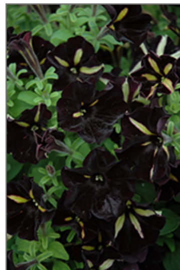
Phantom Petunia flowers