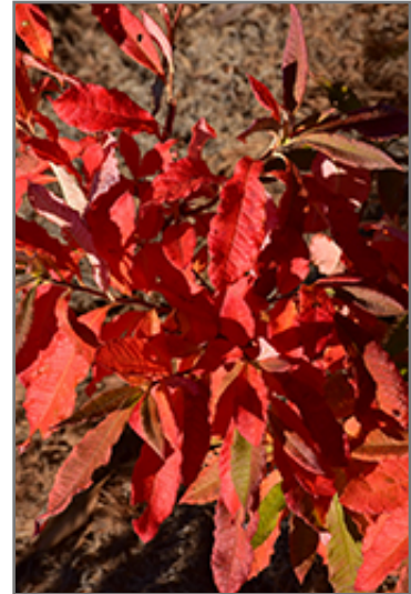
Rosy Lights Azalea in fall

At Dutch Growers, we treat this plant as a "HOBBY PLANT". It is not officially recognized as winter-hardy in our zone 3, however, there is a strong likelihood that it will survive winter. Warranty expires on Nov. 1 season of purchase.